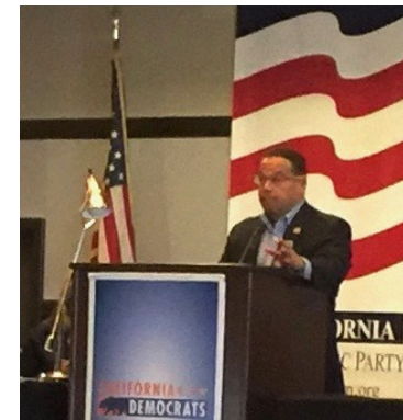
Two of the speakers at the November E-Board