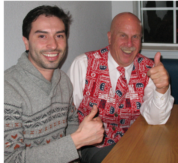
Les’s favorite Republican at the Oakhurst Democratic Club’s Election Night Party!