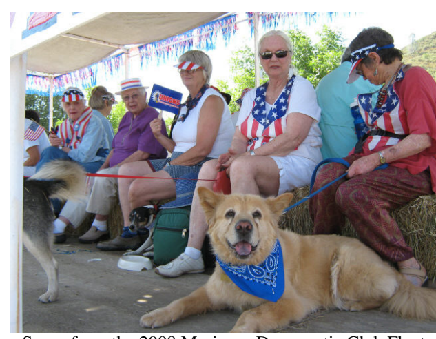
Scene from the 2008 Mariposa Democratic Club Float