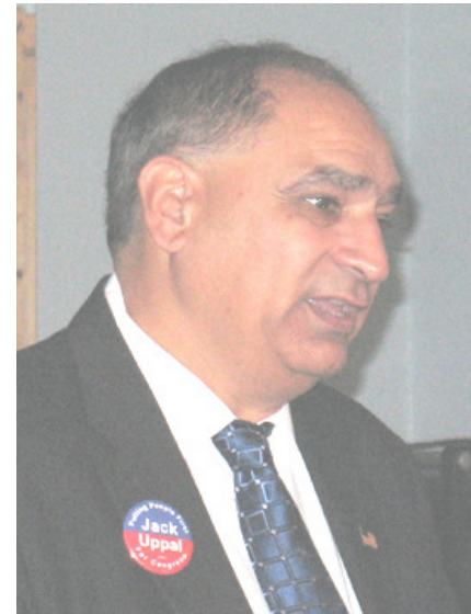
Jack Uppal Candidate for U.S. Congress in California's 4 th District