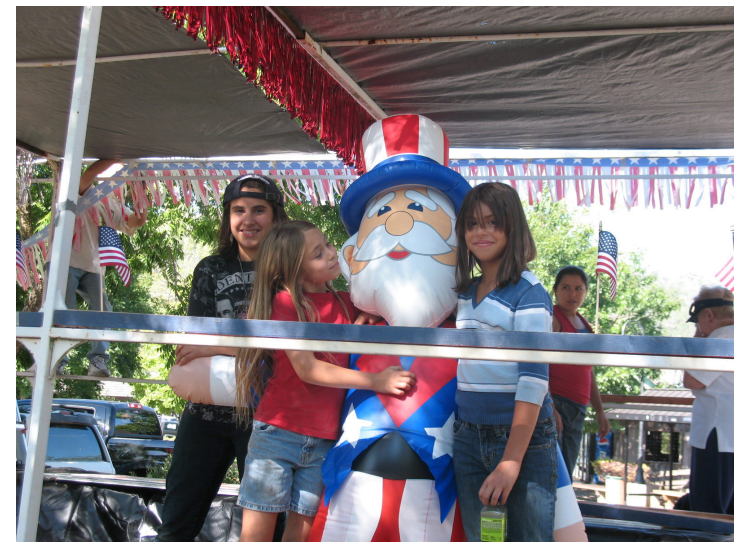
Everybody loves Uncle Sam