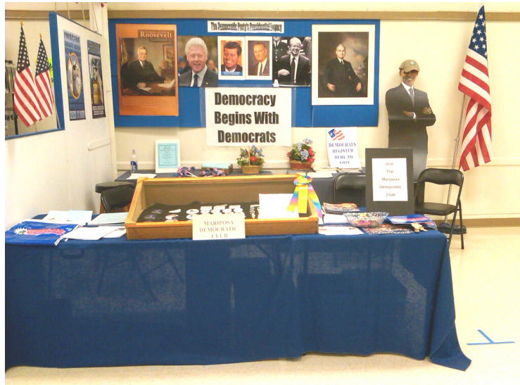
Mariposa Democratic Club Booth at the Mariposa County Fair