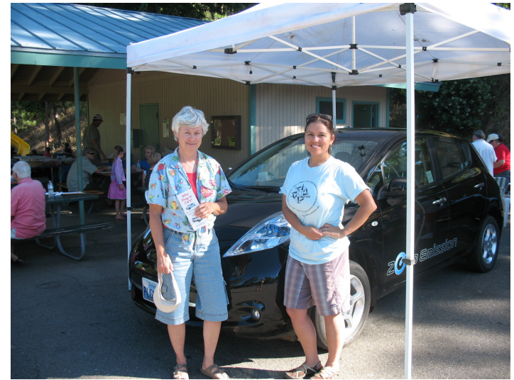
From the Mariposa Democratic Club Summer Picnic