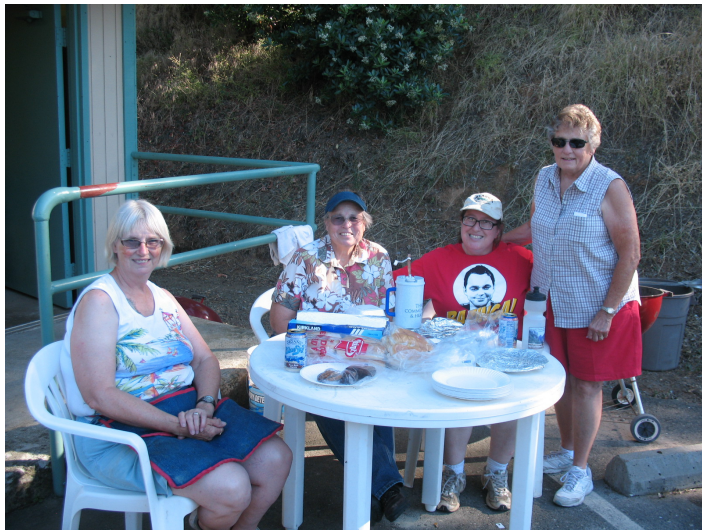
From the Mariposa Democratic Club Summer Picnic