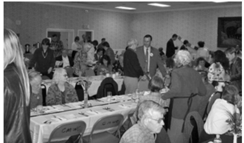
Before the Jefferson dinner at the Mariposa Best Western