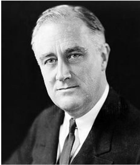
Franklin Delano Roosevelt, star of Capitalism: A Love Story