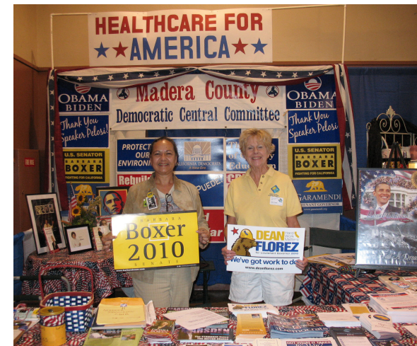
The Madera Central Committee Booth at the Madera Fair