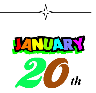
What A Difference A Day Makes

Hope to see you at the next meeting, ready to commit ACTION!