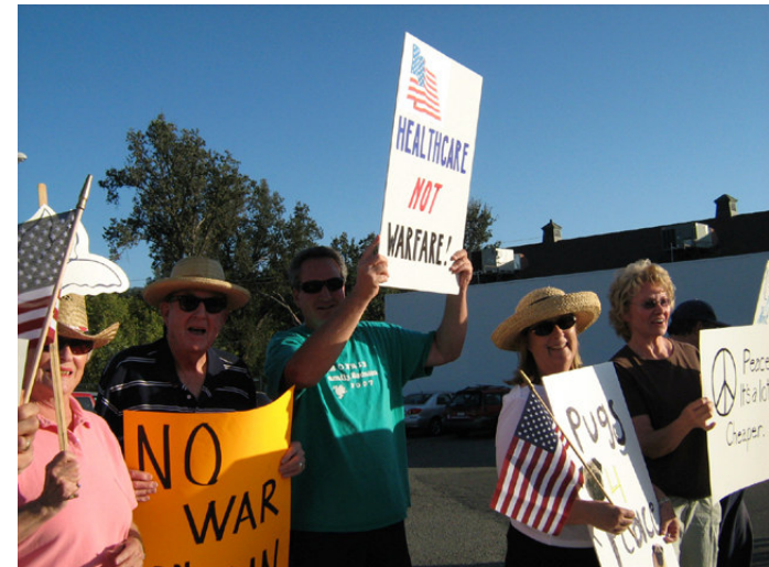
Peace Yosemite, September 19