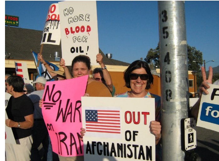
Peace Yosemite, September 19