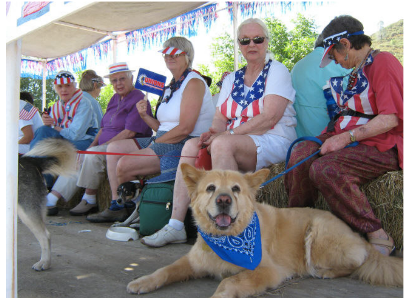
Happy Participants in the Mariposa Parade, August 30th