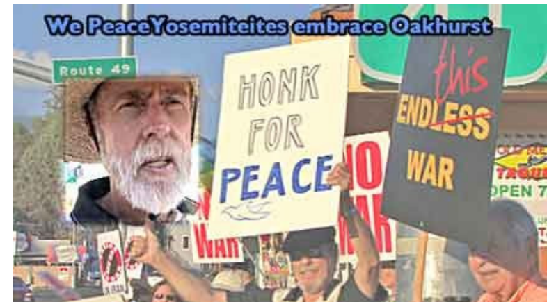
Peace Yosemite Demonstration, Oakhurst, September 19th