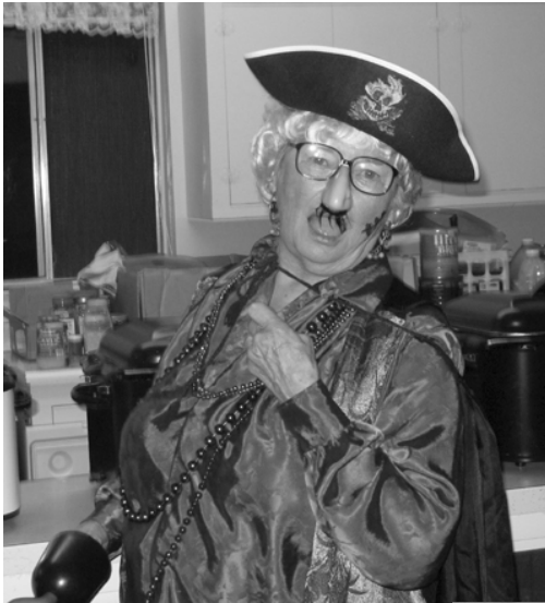
Long John Silver found gold in the kitchen