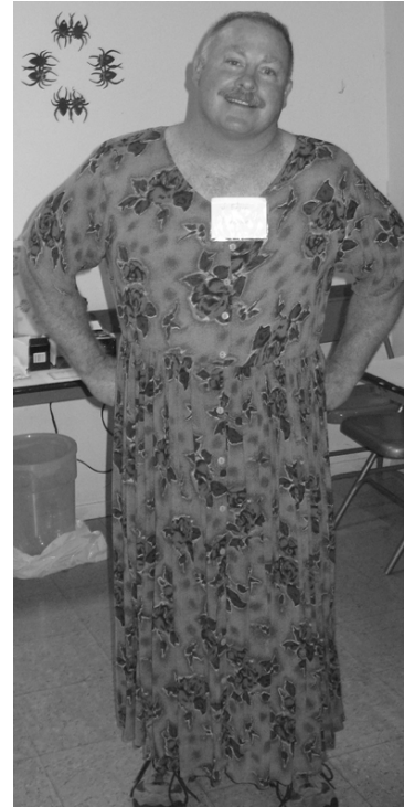
J. Edgar Hoover was there in his very best dress