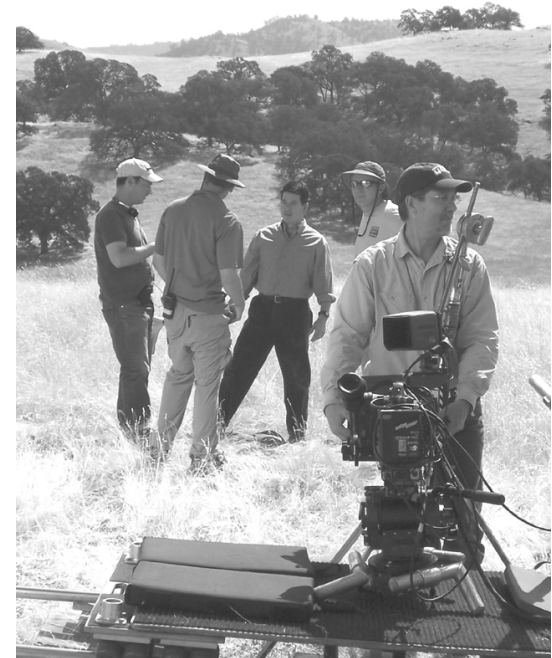
TJ shooting a television commercial