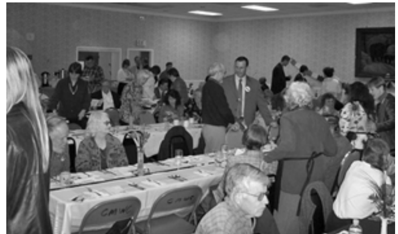
A big crowd had a big time at the annual Jefferson Dinner

An amazing number of people worked before, during, and after to make this yearly event successful. It is a very good feeling to spend an evening with so many thoughtful and insightful people.