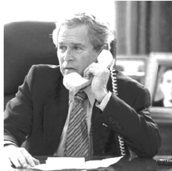
Our President directing FEMA