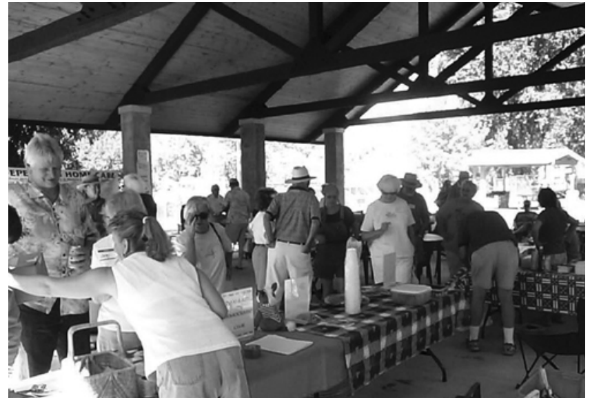
Food and Fun at the Summer Picnic